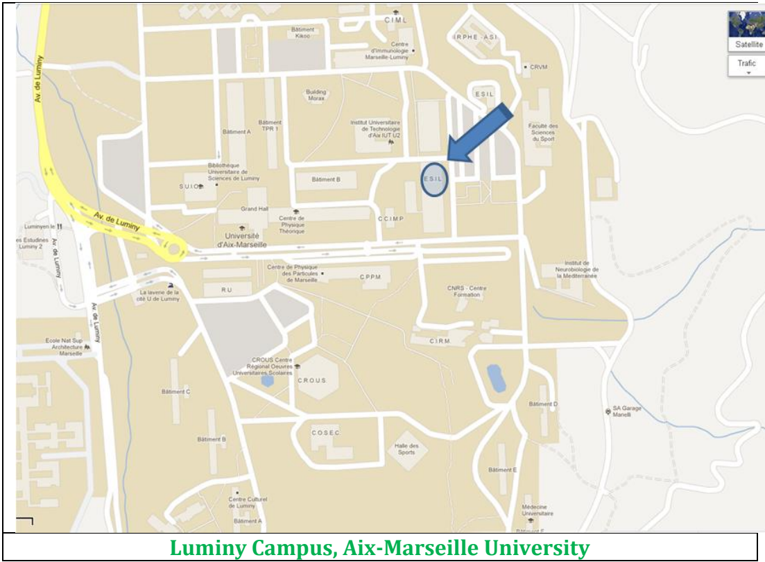
Luminy Campus, Aix-Marseille University