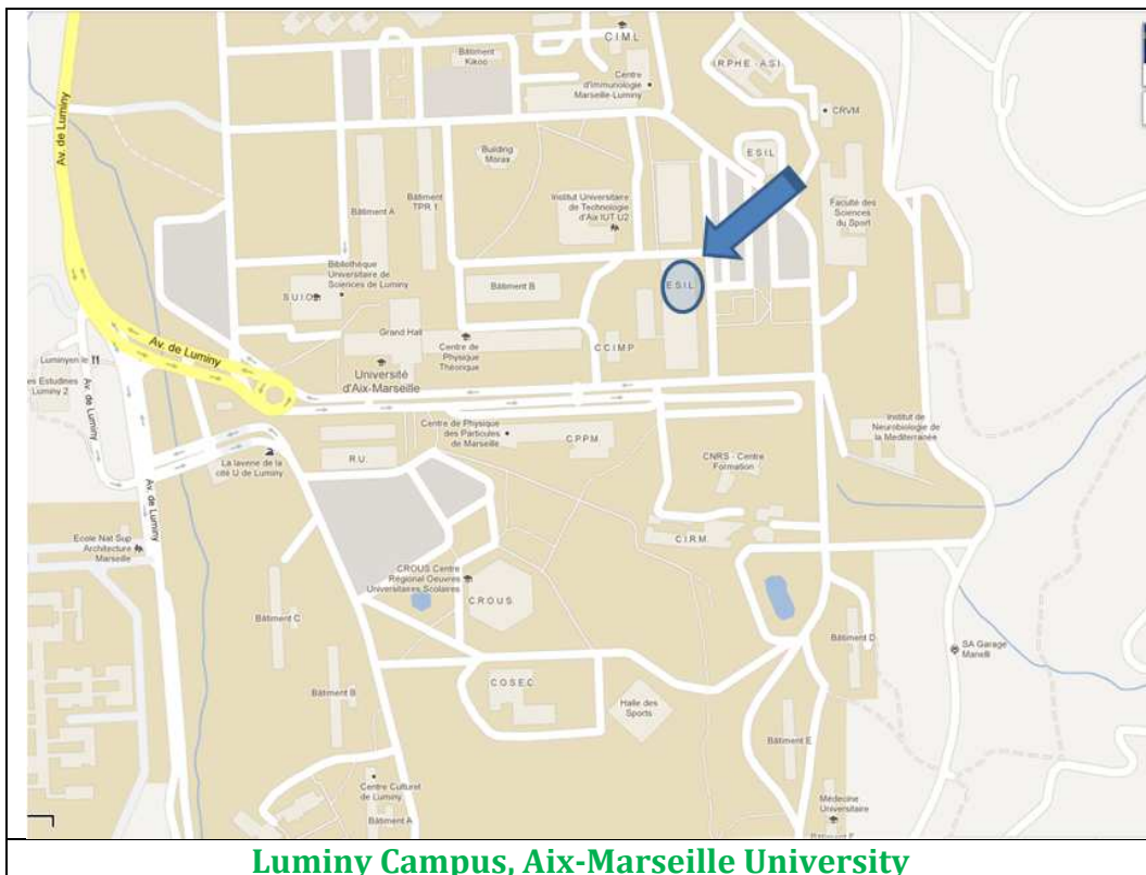
Luminy Campus, Aix-Marseille University